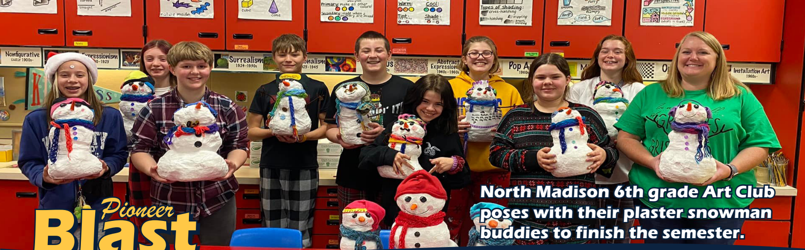
North Madison 6th grade Art Club poses with their plaster snowman buddies to finish the semester.